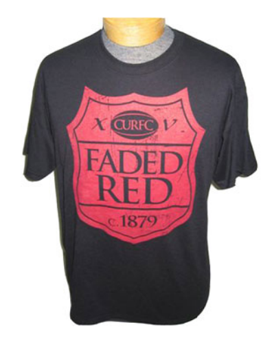
Faded Red Shield T-Shirt